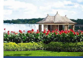
Visit beautiful Queen Victoria Park

Departure: Furniture Fair, 507 Bellfork Rd, Jacksonville, NC @ 8 am then Vernon Park Mall, 814 Hardee Rd, Kinston, NC