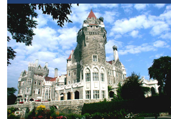
Magnificent Casa Loma Castle in Toronto