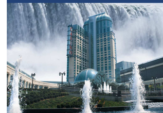
Gaming at Fallsview Casino